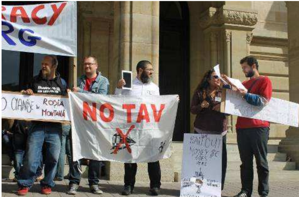
Demonstration: In front of the Euro-Group office of the European Union in downtown Luxembourg