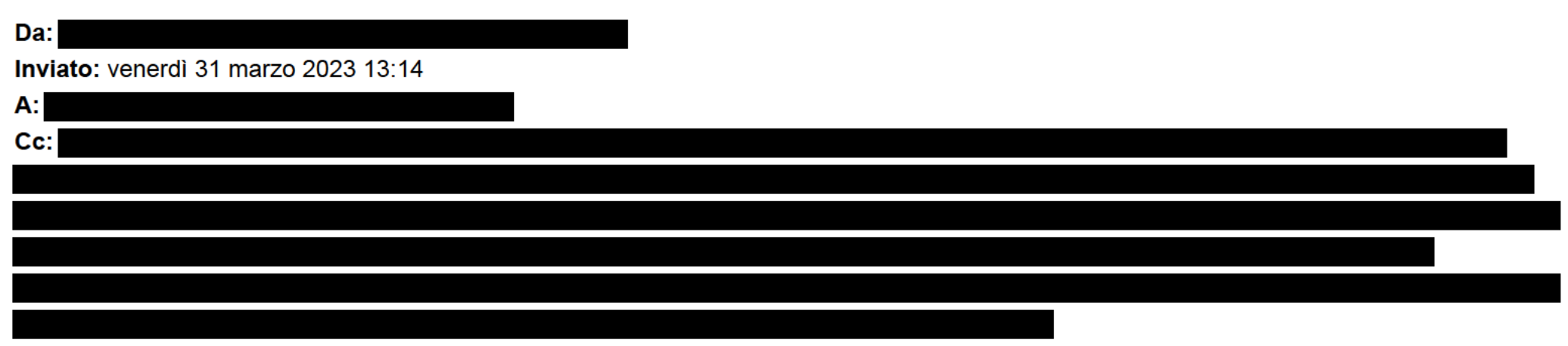
Oggetto: RE: Request for extension of the deadline for the submission of Action Status Report 2014-EU-TM-0401-M - year 2023

M_INF.TER_PROG.REGISTRO UFFICIALE.I.0004750.31-03-2023